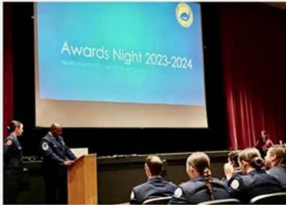
Prairie HS JROTC Awards Ceremony