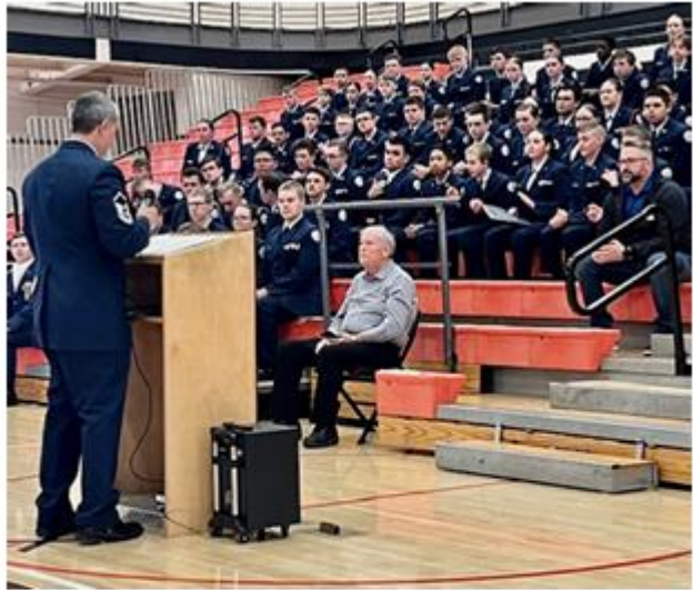
Battle Ground HS JROTC Awards Ceremony Both Schools had over 50 Cadets in the program.