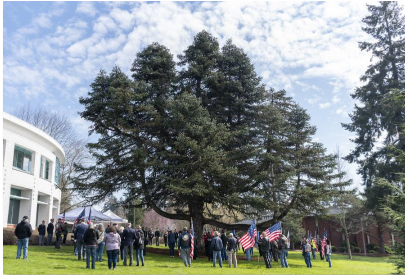
Attendees stand around a Turkish fir, which was designated as a Vietnam Veteran Witness Tree, on Wednesday during a Vietnam War Veterans Day event at Clark College.