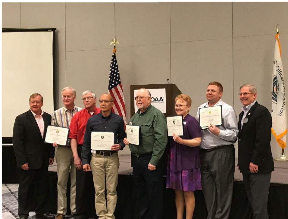
WASCO Communication Award Winners for 2018. Awards presented at the NW Leadership Conference on 3 May 2019.