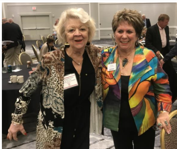
NW Leadership Conference on May 2019.